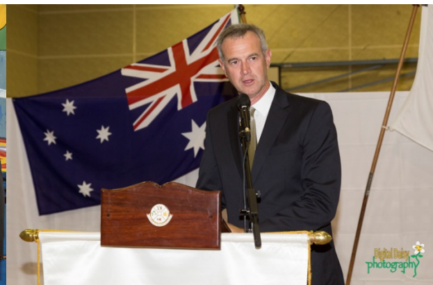
Minister for Local Government, The Hon Tony Simpson MLA