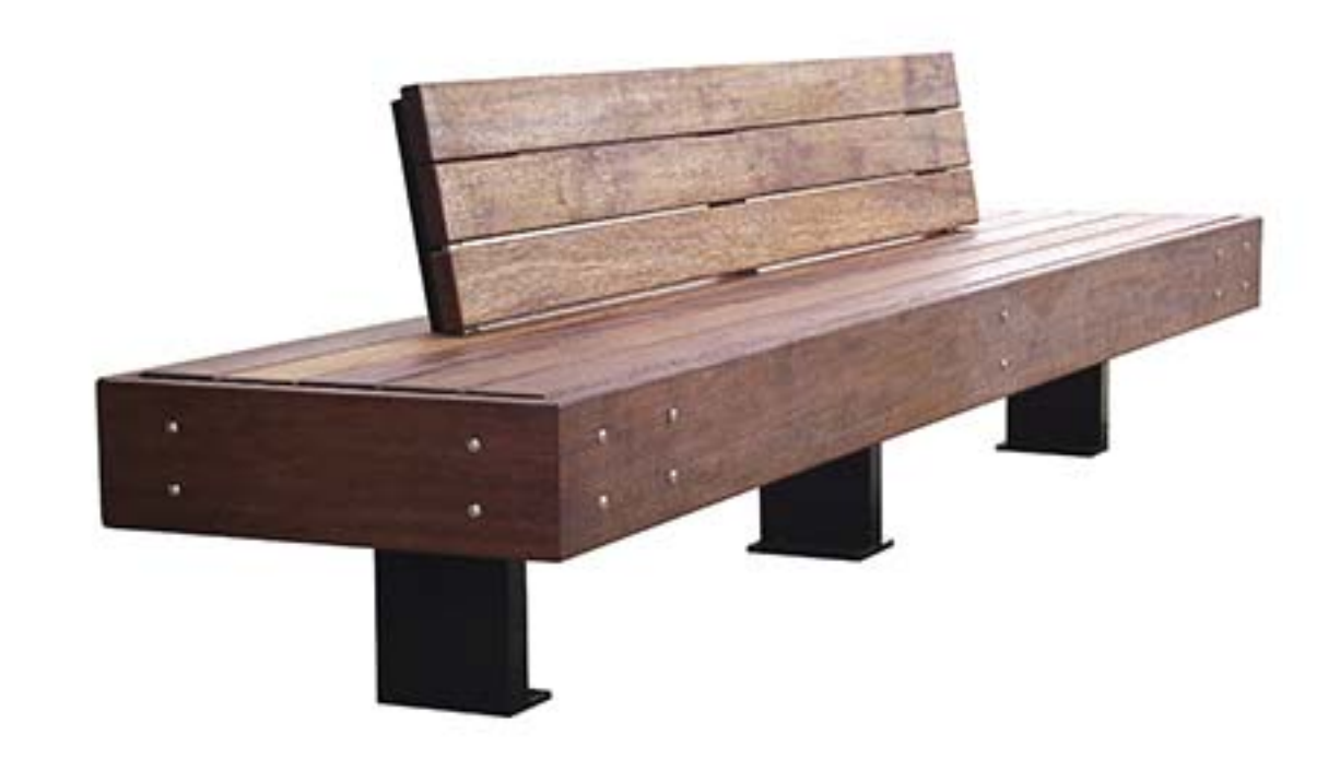
A combination of table settings and bench seats.

Composite material is durable and low maintenance. All examples shown by {\tt ExteriaStreet} and {\tt ParkOutfitters}