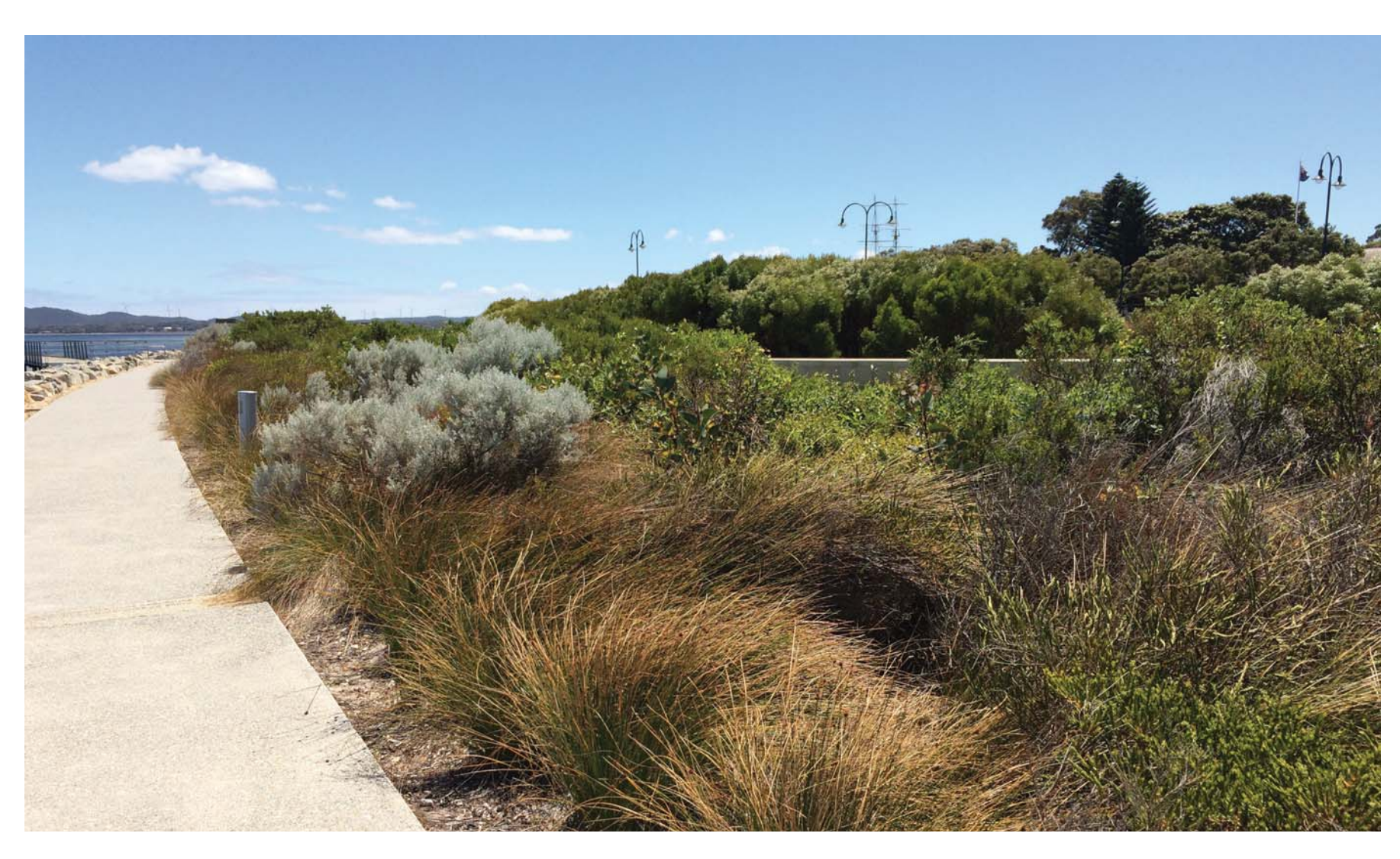
PLANTING Native plant palette to be applyed to edges of the proposed dune/windbreak forms, low growing species of less than 1.5m in height.