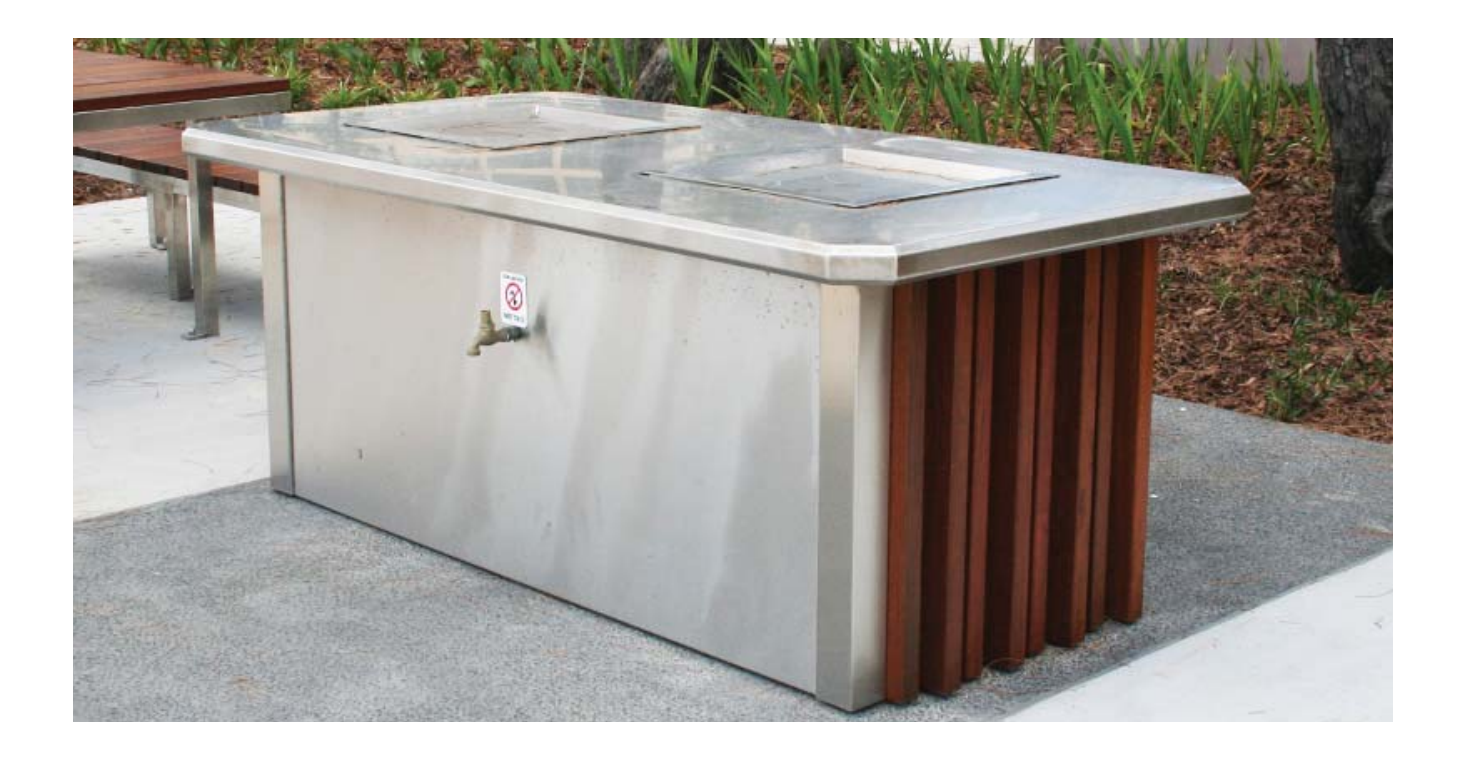
Shower (Exteria), Bin (Exteria), Drinking Fountain (Landmark), BBQ (Landmark)