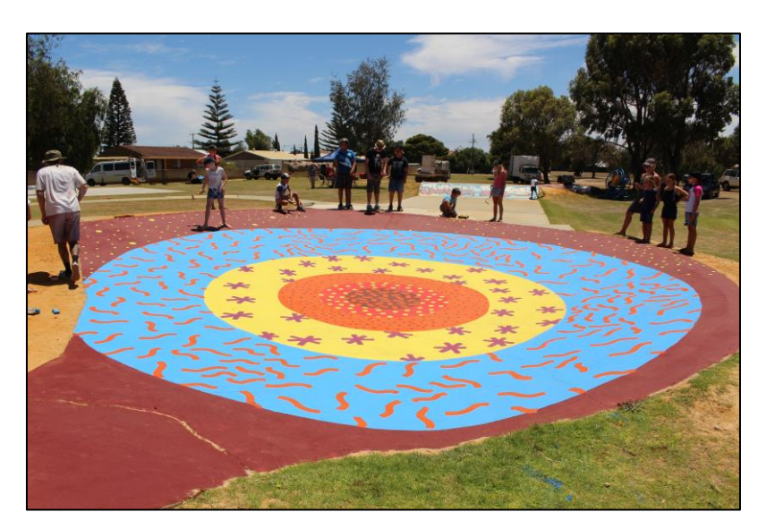
Spray the Grey Community event, Jurien Bay