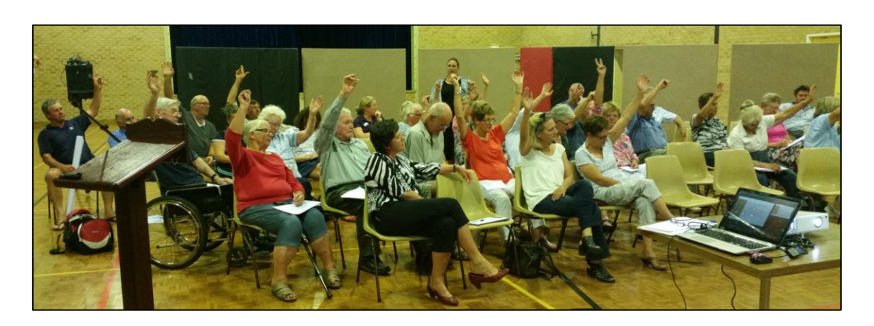
Dandaragan Community Consultation Workshop