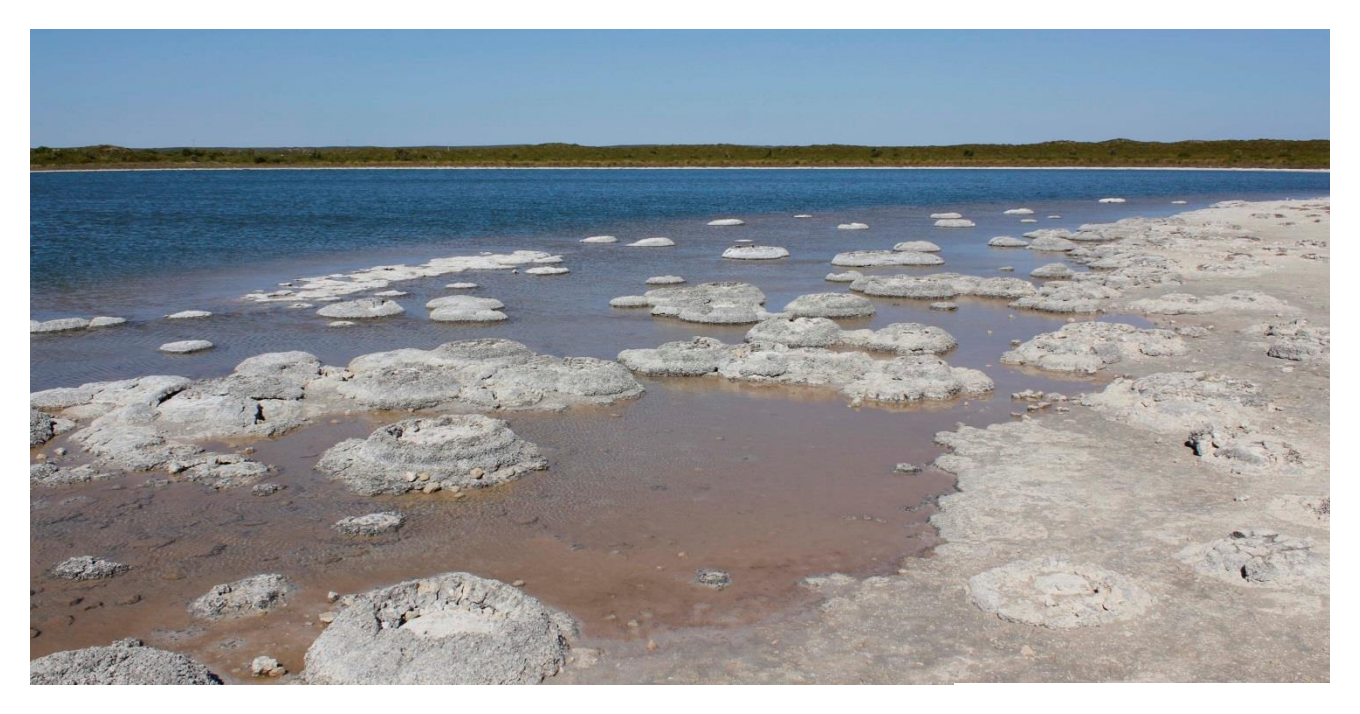
Lake Thetis, Cervantes

What level of risk is associated with the option? How can it be managed? Does the residual risk fit within our risk tolerance level?