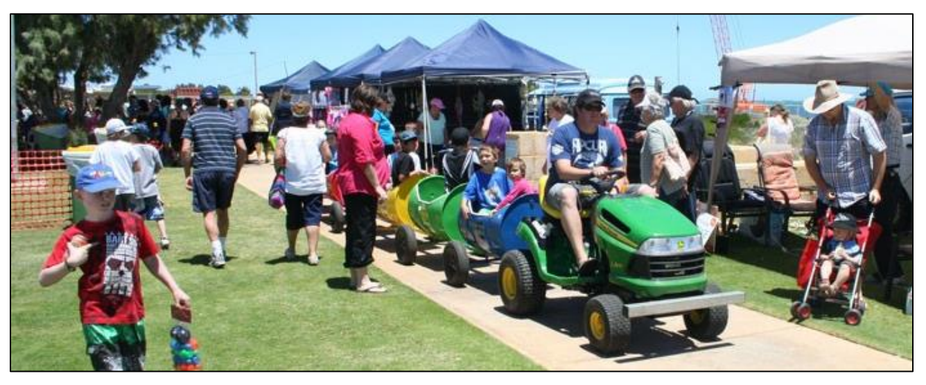
Indian Ocean Festival

Council has a role as civic leader in the community. With strong leadership and community support, it can achieve much more than just through its own direct service delivery. For example, working with businesses on tourism development is an act of civic leadership, facilitating better outcomes through "joined up" planning and action.