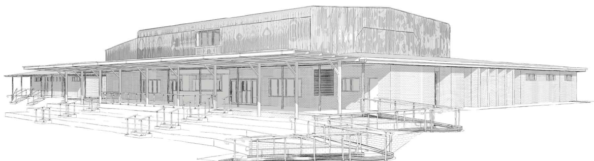
COMMUNITY HALL 3D VIEWS