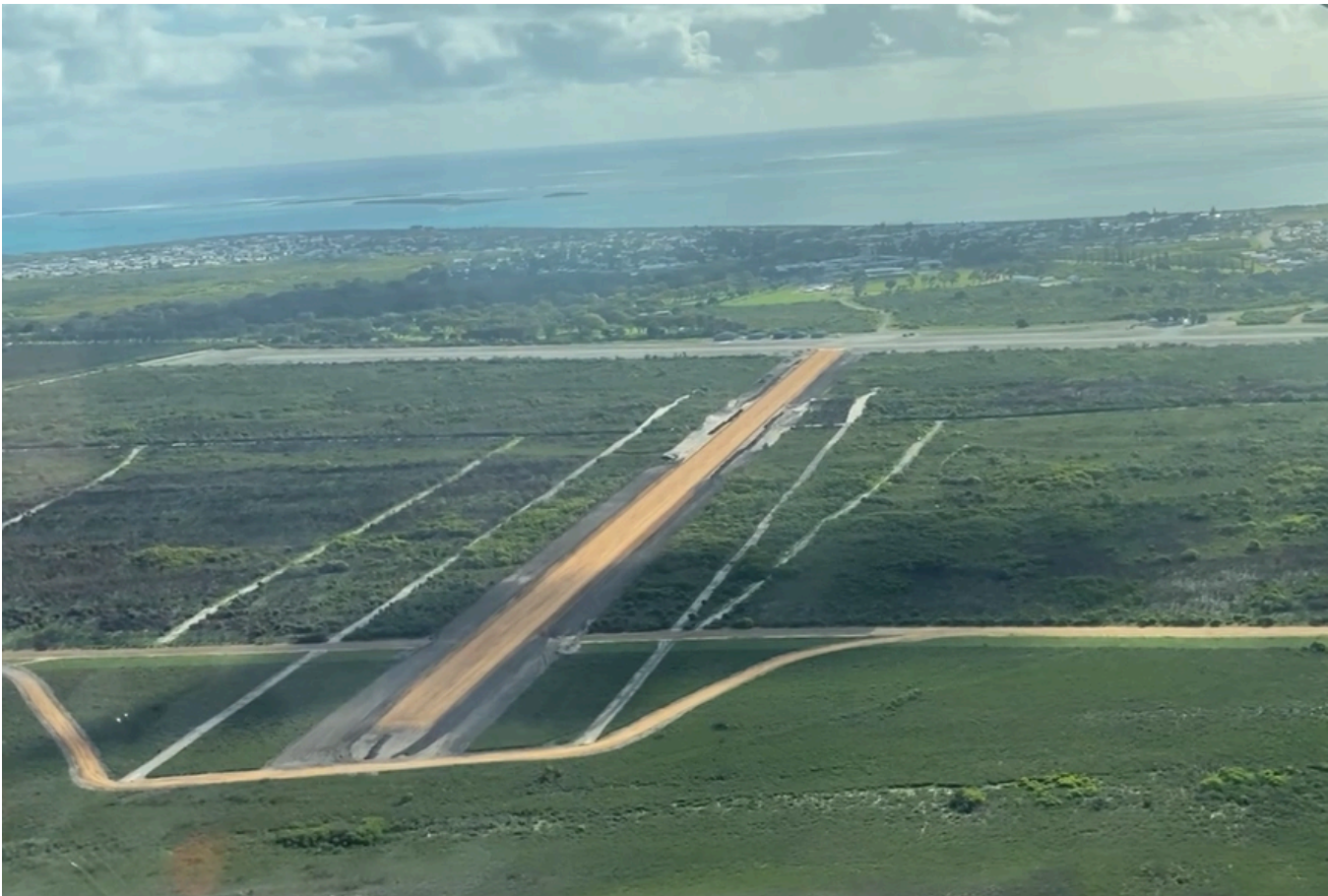
NEW EAST WEST RUNWAY UNDER CONSTRUCTION AT JURIEN BAY AIRPORT