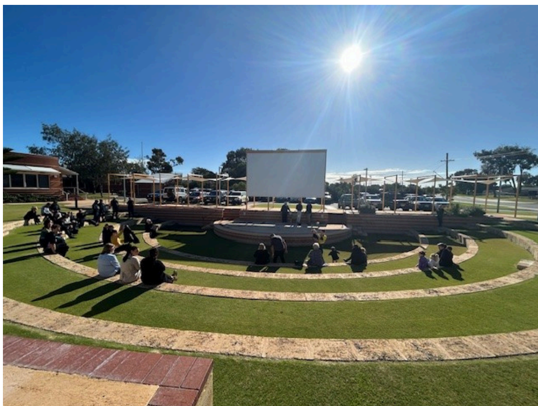
CELEBRATING NAIDOC HISTORY EVENT