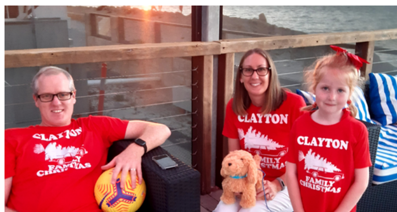
Staff Christmas Party 2020