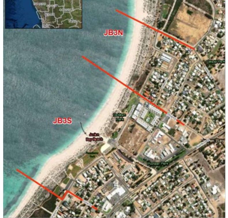
Jurien Bay Study Area

The CAI builds on the first pass Coastal Hazard Risk Management and Adaptation Plan (CHRMAP) for the Shire which was completed in 2018 by Cardno. The CHRMAP broadly considered the coastlines of Cervantes and Jurien Bay and surrounding area. It is noted that the CHRMAP and the subject CAI only consider the coastal hazard of erosion; storm surge inundation coastal flooding