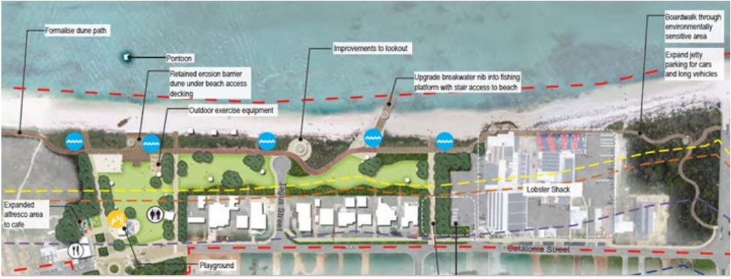
Cervantes Foreshore Masterplan extract

Once the coastal management option design is in hand, the Shire can explore funding models to construct and maintain the coastal protection works for its expected lifespan of 20 years. It is recommended that a further detailed BDA be undertaken at this time to determine the final beneficial payment (currently recommended between 31% and 55% of the cost).