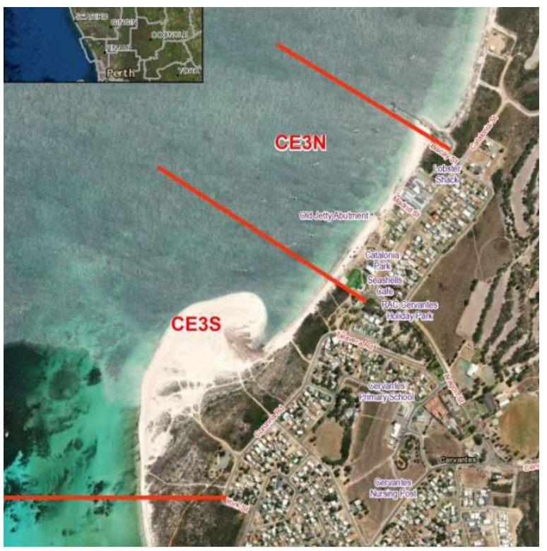
Cervantes Study Area