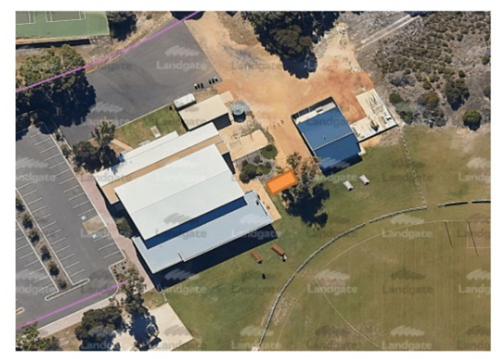
Cervantes Recreation Centre & Cervantes Football Club Changeroom with the proposed development shown by the orange rectangle.

To reinvest the funds received from operating overflow camping, the Recreation Centre Committee Cervantes proposes the development of a 64m<sup>2</sup> sheltered, timber framed, Colorbond clad, outdoor camp kitchen with an electric barbecue, benchtops and six picnic tables between the existing recreation centre gymnasium and the Cervantes Football Club changeroom.