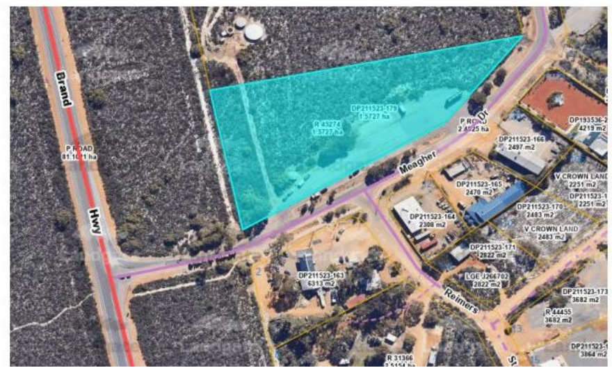
Reserve 45274, Lot 179 (No.1) Meagher Drive, Badgingarra

The purpose of the report is for Council to consider granting development approval for the permanent erection of a CBH grain sample facility within the Badgingarra truck parking bay at 1 Meagher Drive, Badgingarra.