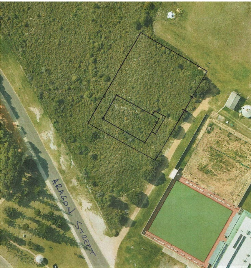
Indicative location plan of the CCMS club premises and leased area

In December 2022, the CCMS entered into a lease agreement with the Shire for a 2,925m<sup>2</sup> unutilised portion of the existing Cervantes Golf Course Reserve. This was a priority recommendation of the Cervantes Recreation Precinct Masterplan which was adopted by Council in September 2022.