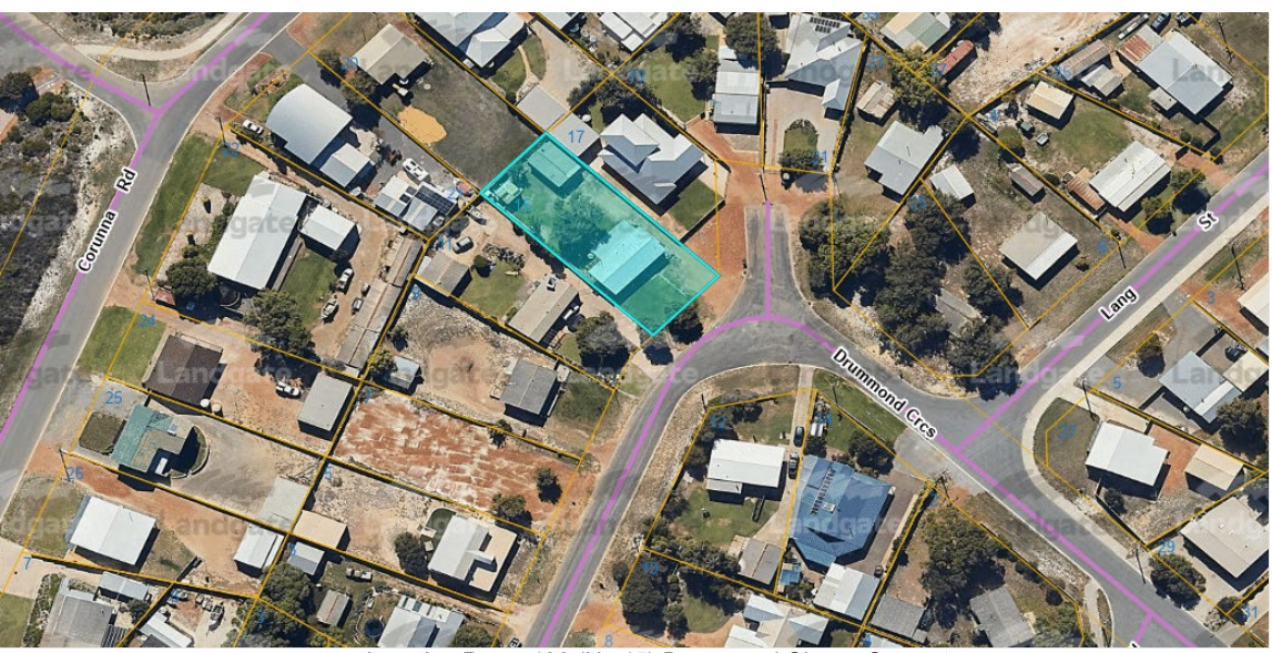
Location Pan – 120 (No.15) Drummond Circus, Cervantes

The proponent is seeking development approval for the use of Lot 120 (No.15) Drummond Circus, Cervantes as a commercial holiday house.