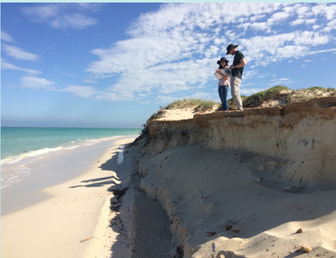
Coastal erosion - Jurien Bay

CHRMAPs are developed under the State Planning Policy 2.6: The State Coastal Planning Policy .