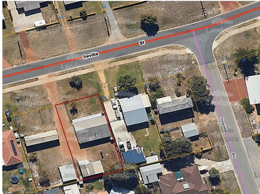
Location Pan – Lot 350 (No.71) Seville Street, Cervantes

The proponent is seeking development approval for the use of Lot 350 (No.71) Seville Street, Cervantes as a commercial holiday house.