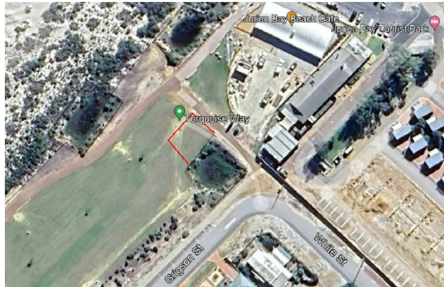
Proposed helipad location on Reserve 28541 marked in red outline.