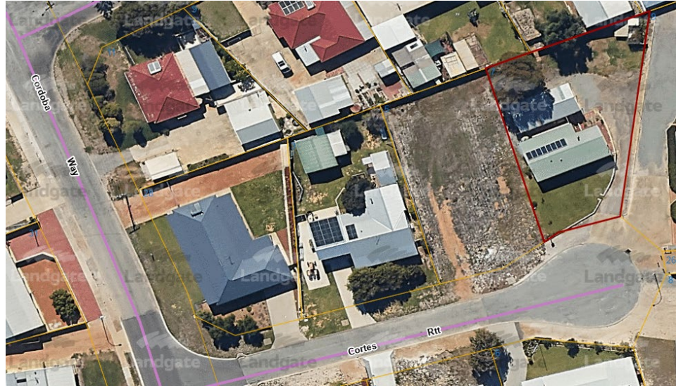
Location Pan – Lot 773 (No.7) Cortes Retreat, Cervantes