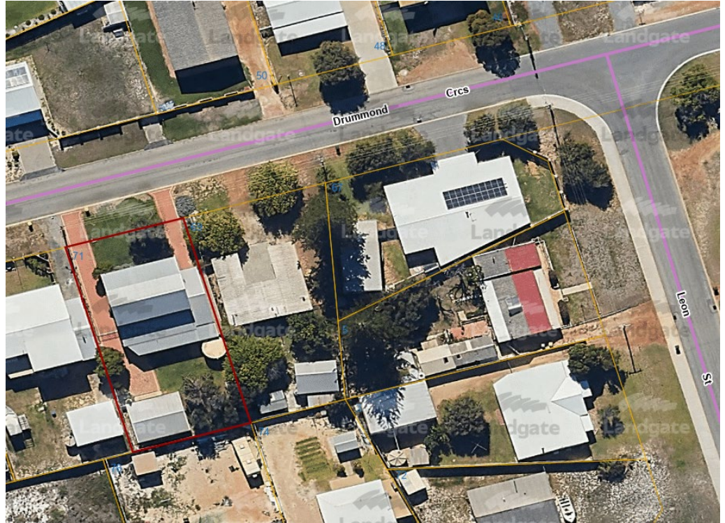
Location Pan – 291 (No.71) Drummond Circus, Cervantes