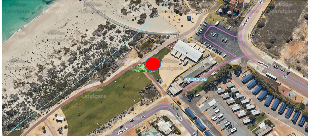
Location Plan - Reserve 28541, Part Lot 303 (25) Roberts Street, Jurien Bay