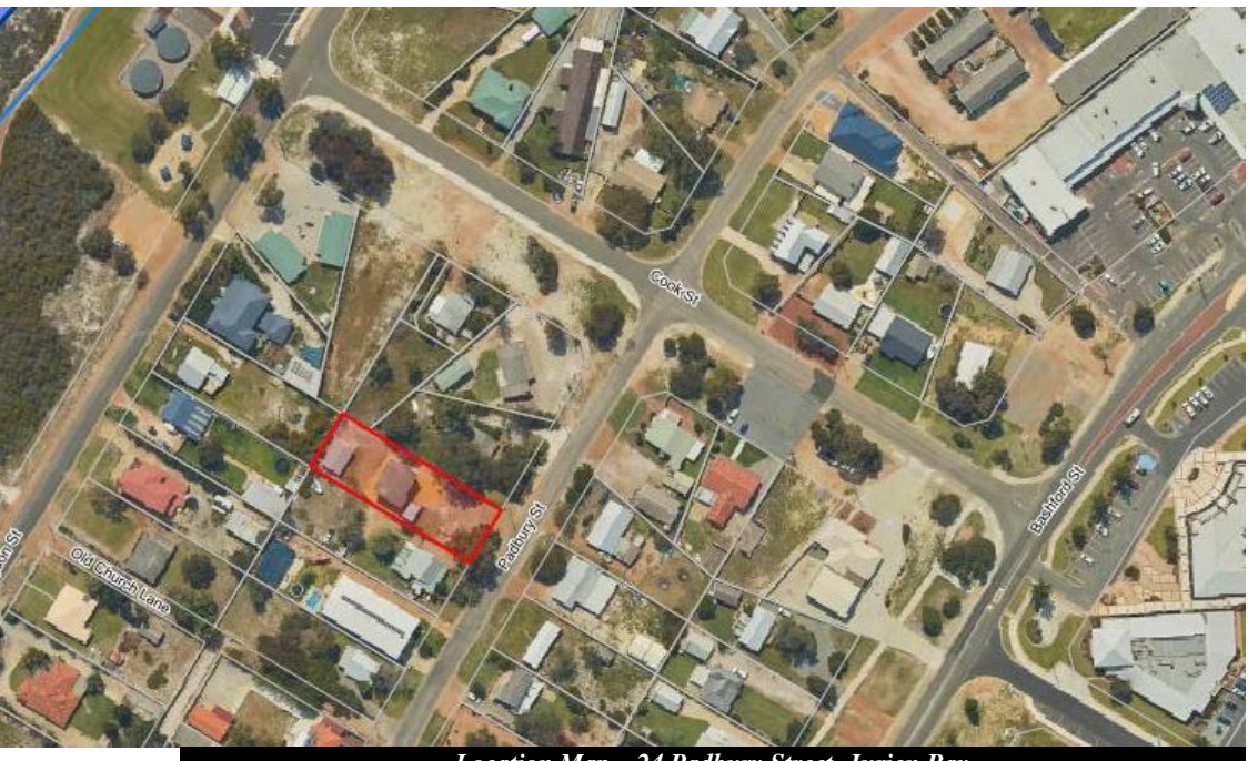
Location Map – 24 Padbury Street, Jurien Bay