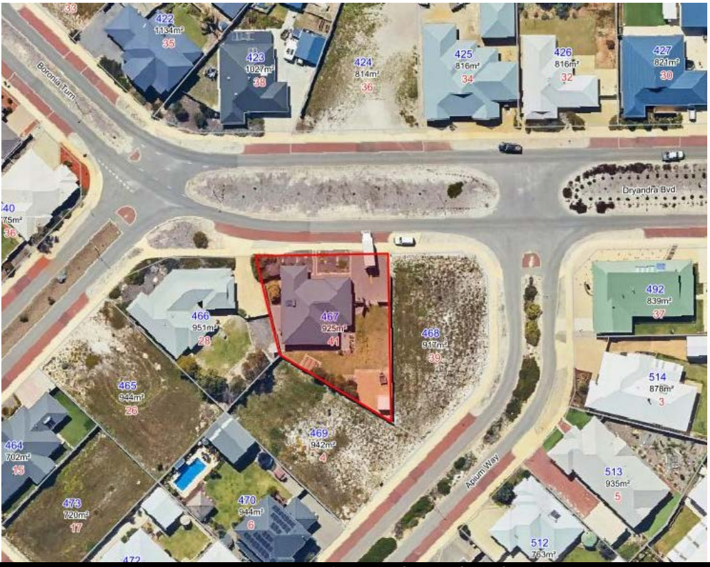
Location Map – 41 Dryandra Boulevard, Jurien Bay

The proponent is seeking development approval for an oversized outbuilding on Lot 467 (#41) Dryandra Boulevard, Jurien Bay.