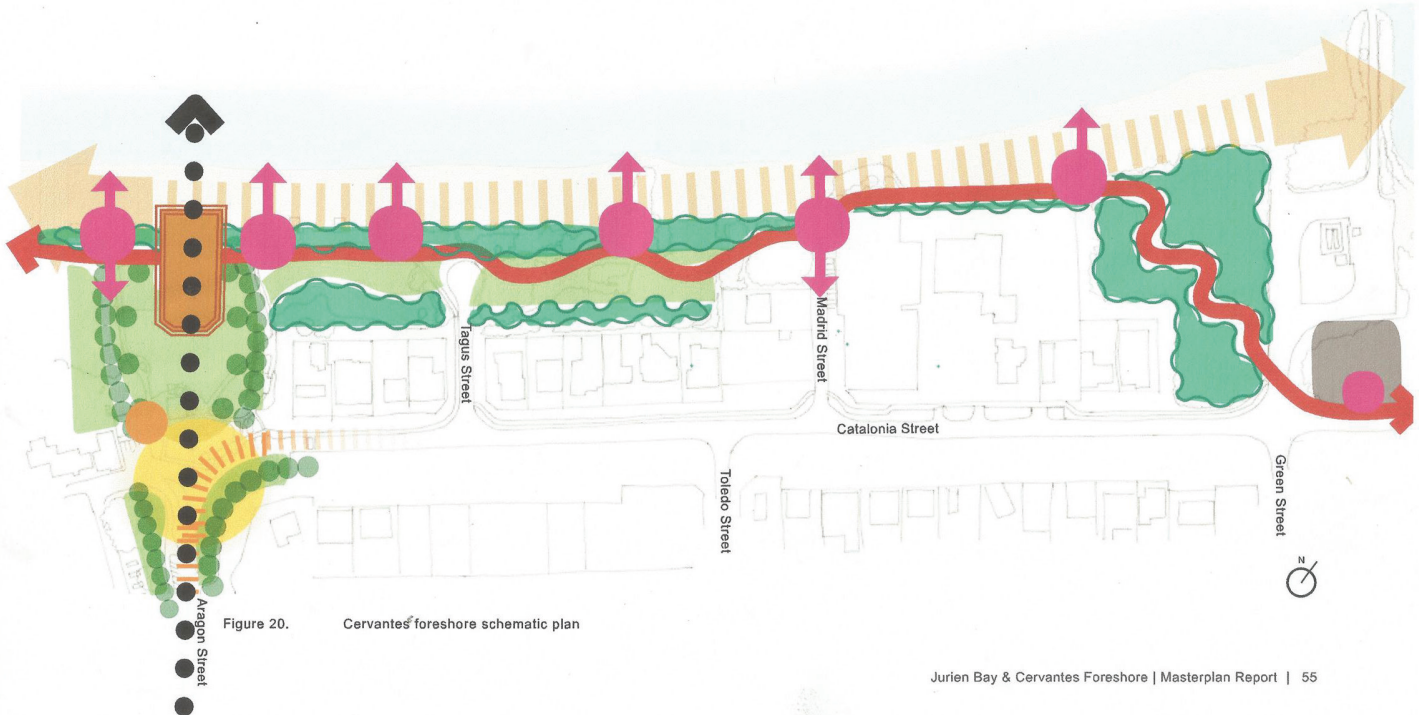
Figure 20. Cervantes' foreshore schematic plan