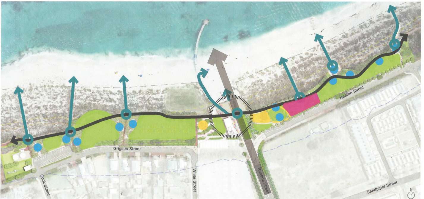
Figure 5. Jurien Bay Schematic Plan

0m 25m 50m 100m 200m Jurien Bay & Cervantes Foreshore | Masterplan Report | 17